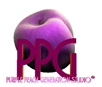
Transcription by Purple peach generation studio 2013 \ensuremath{\mathbb{R}}